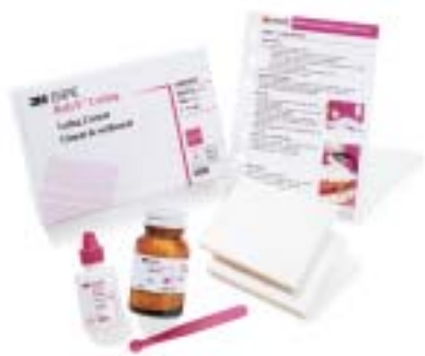
RelyX™ Luting Cement Kit: 3505