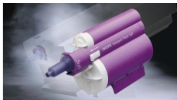
IMPREGUM PENTA SOFT is automatically mixed and dispensed in the PENTA-system.