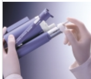
Slide PENTAMATIC foil bags into the cartridge