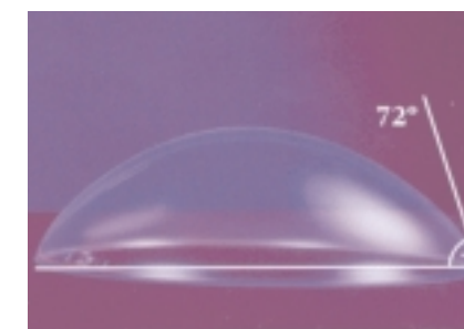
Water droplet on unset IMPREGUM PENTA SOFT. The low contact angle is due to its inherent hydrophilicity.