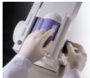
Place cartridge in the PENTAMIX