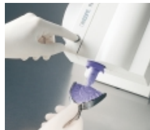
Press start button for automatic mixing and dispensing

Now available in 3M ESPE's unique PentaMatic self-activating delivery system (no more opening, simply load the cartridge into the Pentamix and press a button.)